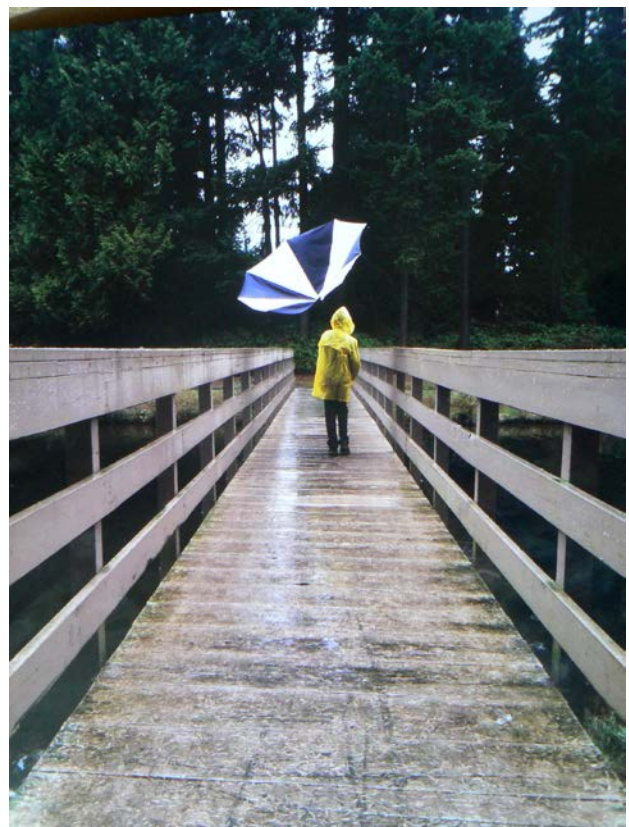
Most in the northwest can relate to Hailey Pelletier's photo "Umbrella in a Rainy Windstorm" (above). The first-grade photographer is from Penny Creek Elementary.